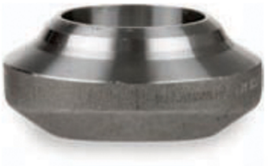
Fig. 43W03 – Welded Outlet